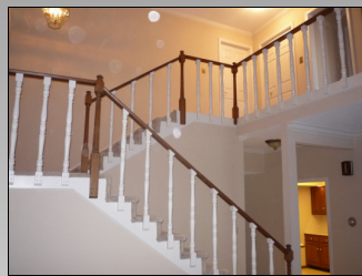
Master Suite downstairs, two bedrooms upstairs.

TERMS: The successful buyer will make a deposit of 10% of the sale price at the sale. The balance and full possession, within 30 days. Like the rest of The Oaks, this property is 294.8 ft. elevation and within the AE flood zone. Broker Co-op welcomed.