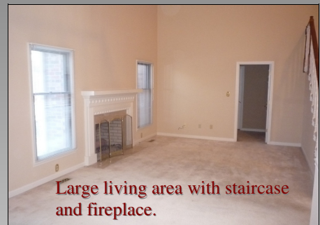
Large living area with staircase and fireplace.