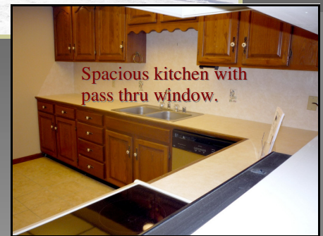
Spacious kitchen with pass thru window.

The Oaks Town Home Council of Co-Owners maintains the outside of the condo, such as painting, repairs, landscaping. Residents & guests have access to the swimming pool and may reserve the club house for meetings and parties. Inside pets are allowed. Contact the Council at 270-926-1441 for details.